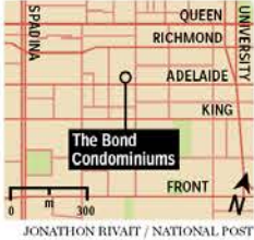
JONATHAN RIVAIT / NATIONAL POST